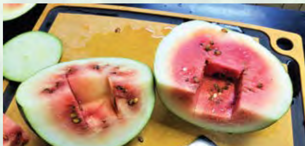
With competitor's coating powder

Once the watermelons were cut open, there was a noticeable difference between the watermelons grown with 10-10-10, the competitor's watermelons, and the SGW watermelons. The Jack & Stalk and NPE 442 watermelons had a noticeably riper, darker red, color compared to the other two. The Wildfire Mn-F Spray also had some reddening but had a larger watermelon size compared to the others. The Jack & Stalk treatments produced the largest yield.